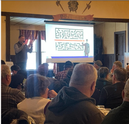
February - Winter Meeting