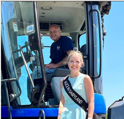
July - Lodi Ag Fair "Buddy Seat"