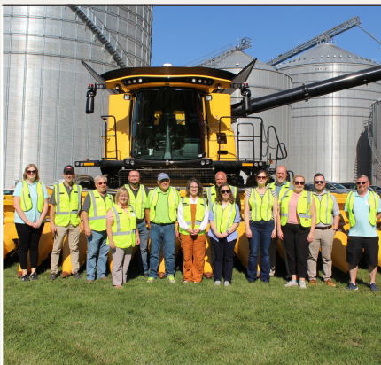
October - Tours