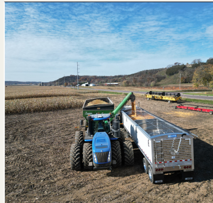
October - Harvest begins!