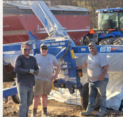
April - last bag from 2022 picked up!